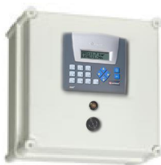
O2 depletion alarm