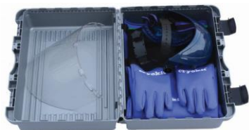
Cryogenic safety equipment